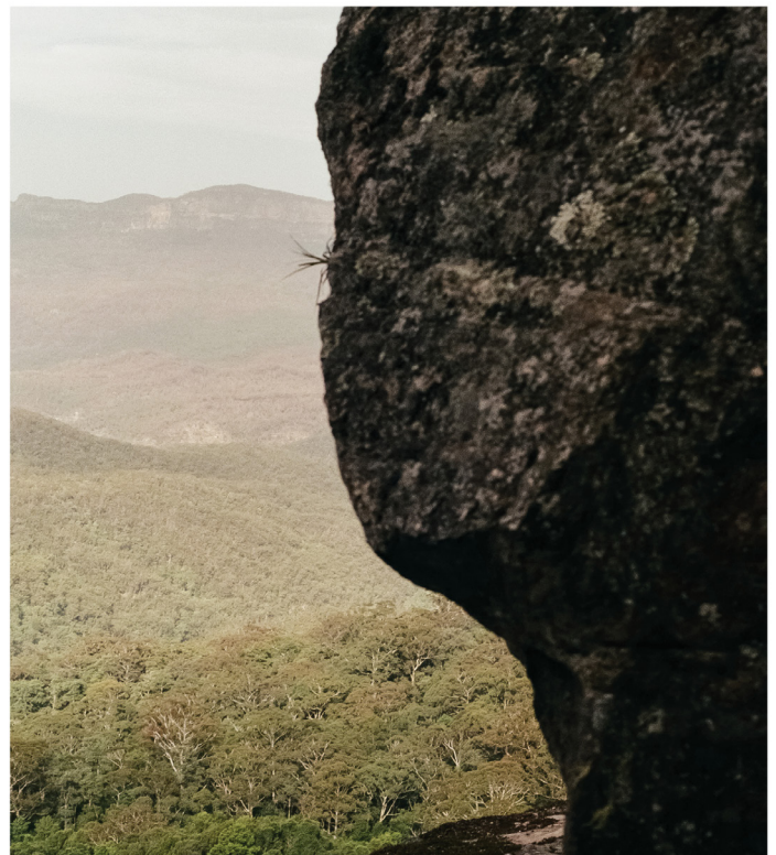
Detail from Connor Xia, 'Melting Point', 2019.