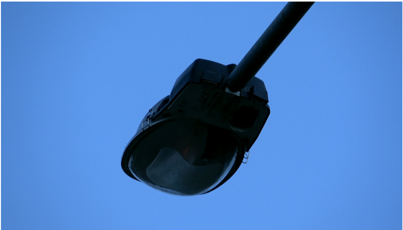
Peter Kozak, still from Streetlight , 2019, 4K video, 2:43 minutes.

The intention behind this pairing is to consider the way that different dichotomies operate, such as private/public, hidden/visible, and how these might be questioned or challenged to lessen or break down the taboos around talking about private issues or showing dysfunctionality in public space.